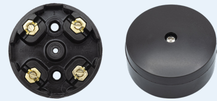
491 Internal View