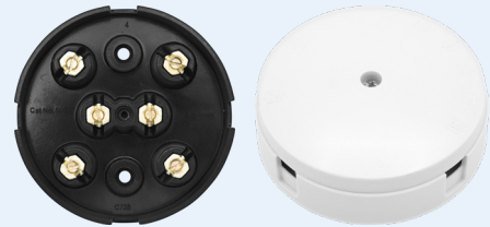
606 Internal View